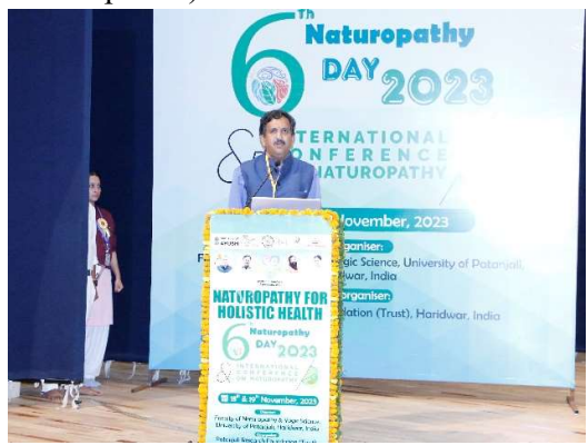
Dr. Raghvendra Rao (Director at Central Counsel of research in Yoga and Naturopathy) Ministry of AYUSH, Government of India

Video messages were shared by <u>Dr. Saruanand Sanowal ji</u> (Union Minister of Ports, Shipping and Waterways and Ministry of AYUSH, Government of India) and <u>Dr. Mahendra Munjapara ji</u> (Minister of State for AYUSH and Minister of State for Woman and Child Development).