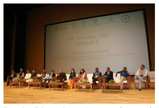
The theme of conference was Naturopathy For Holistic Health. Several panel discussions were conducted.

Panel Discussion the on topic "Naturopathy Principles Clinical in Challenges Practice: and Need for Rationalization"